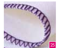
3-thread wrapped overlock wide Perfect for finishing skirts or as lettuce edge on fine fabrics.