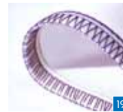
5-thread safety stitch, wide A durable chainstitch seam with overlock edge sewn in one step, for garment sewing, quilt piecing and other projects.