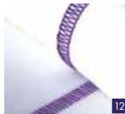
3-thread flatlock, wide For sewing stretchy fabrics together with a decorative effect either with the flatlock side or the ladder stitch side.