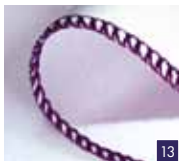
3-thread rolled edge Give a professional finish to silky scarves, pillow ruffles and napkins.