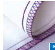
5-thread safety stitch, narrow A durable chainstitch seam with overlock edge sewn in one step, for garment sewing, quilt piecing and other projects.