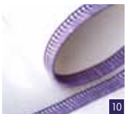
3-thread stretch overlock For sewing extra stretchy light or medium weight fabrics. (Add additional stretch by using a stretchy type thread in the loopers.)