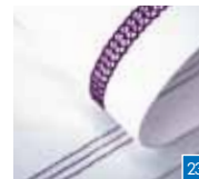
Coverstitch triple For hems on stretch fabrics and for decorative effects on all kind of fabrics. Use decorative thread in looper for embellishment.