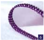
2-thread narrow edge Edge finish for light and medium weight woven fabrics and lightweight knits.