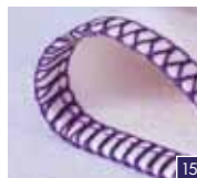
4-thread overlock Seam, overcast the edge and trim away excess fabric in one step. For all seams where stretch or give is needed, such as neck edges, side seams, sleeves.