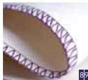
3-thread overlock, wide & narrow Seam, overcast the edge and trim away excess fabric in one step.